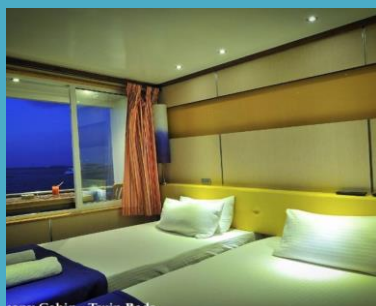
Cony Cabin - Twin Beds